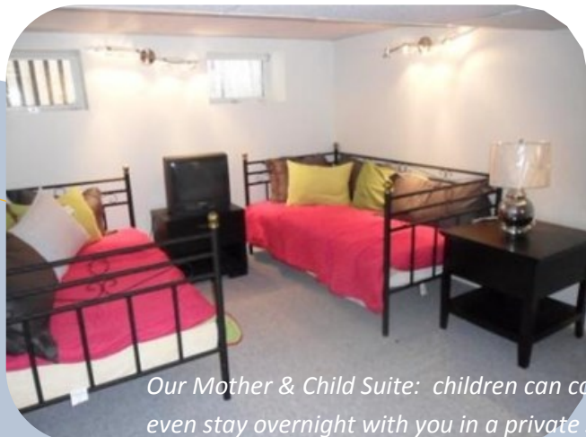
Our Mother & Child Suite: children can come and visit, even stay overnight with you in a private setting.